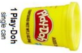
1 Play-Doh single can