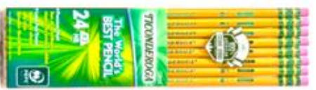
1 Box of 24 regular pencils #2