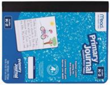
2 PRIMARY Journals with blank space to draw