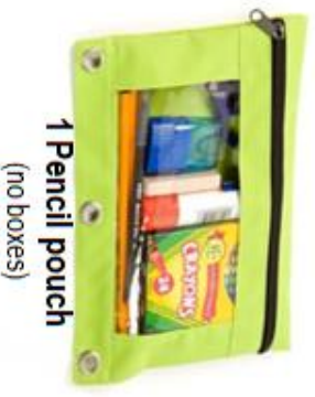
1 Pencil pouch (no boxes)