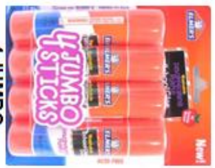
4 JUMBO glue sticks