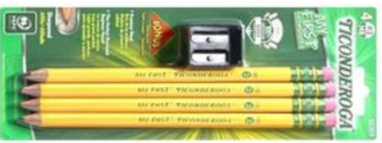
12 JUMBO pencils