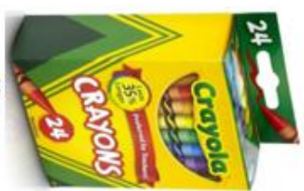
4boxes 24 count Crayola Crayons