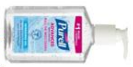
1 hand sanitizer with pump or 70% Isopropyl alcohol