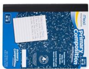
2 PRIMARY Notebooks with blank space to draw