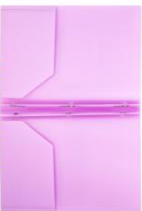
2 PLASTIC duo-tag folder with pockets