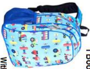
1 Book bag