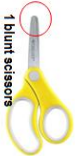
1 blunt scissors